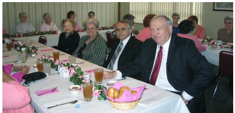
Volunteer Month Auxiliary Luncheon

Most all of the members attended and the comments afterwards were favorable. They all enjoyed it!