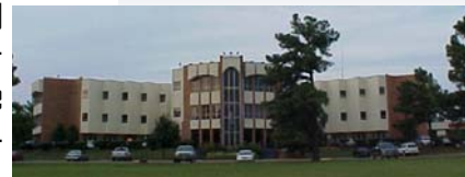
Working for a Healthier Community