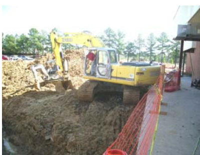
Site preparation for new structure

a special election to ask the voters to extend the ½ cent sales tax, according to the Don Shaw, Chairman. The current tax was approved by the voters for a five year period which expires on June 30, 2009 and can be used only for