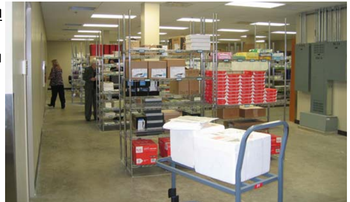
New Materials Management Storeroom

Town Hall Meetings to Learn about the coming Sales Tax Election Battiest School Cafeteria, Monday Feb 16th at 6:30 pm M M Hospital Conference Room Thursday Feb 19th at 6:30 pm Broken Bow Library, Thursday Feb 24th at 6:30 pm