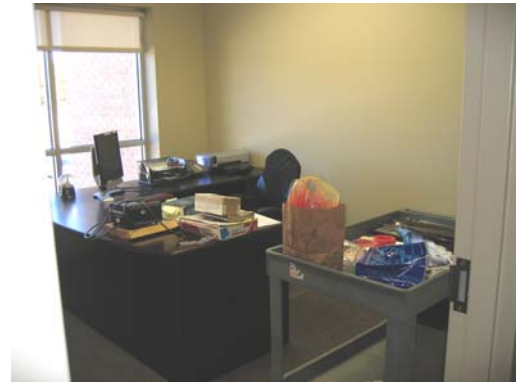
An office in the new North Tower during the move.