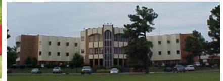
Working for a Healthier Community