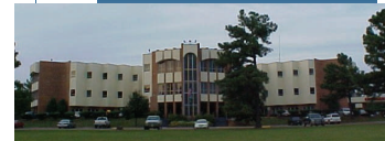
Working for a Healthier Community